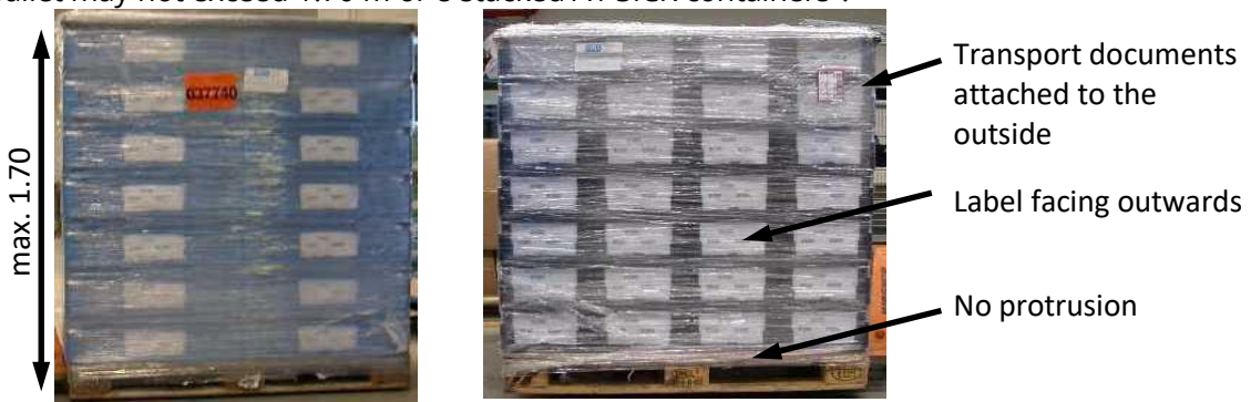
Figure 1: Euro pallet with A1 or A3 containers

When shipping numerous packages on a single pallet, the materials are to be stacked separately by type (same materials on top of each other, adjacent to each other in the event of several stacks). The labels on the packages must face outwards and be legible. The height of a loaded pallet may not exceed 1.70 m or 8 stacked A1 SICK containers 4 .