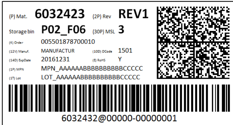
Figure 4: Example Label