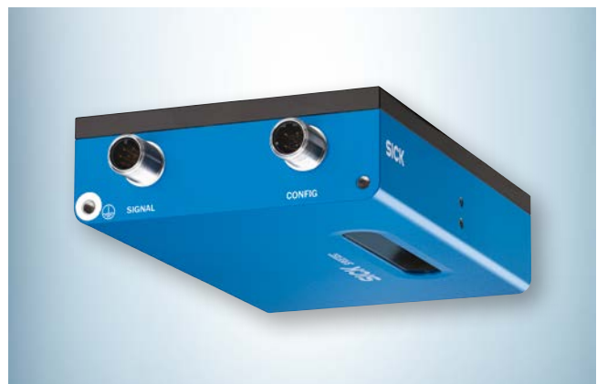
SPEETEC stands for non-contact measurement of speed, length and position.