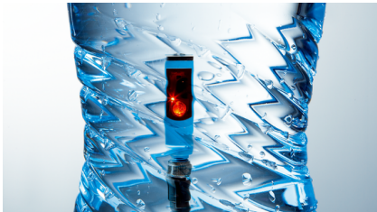
Undefeated in the detection of transparent objects thanks to the ClearSens technology