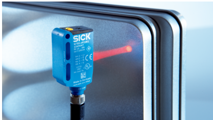
Universal application possibilities due to the excellent background suppression