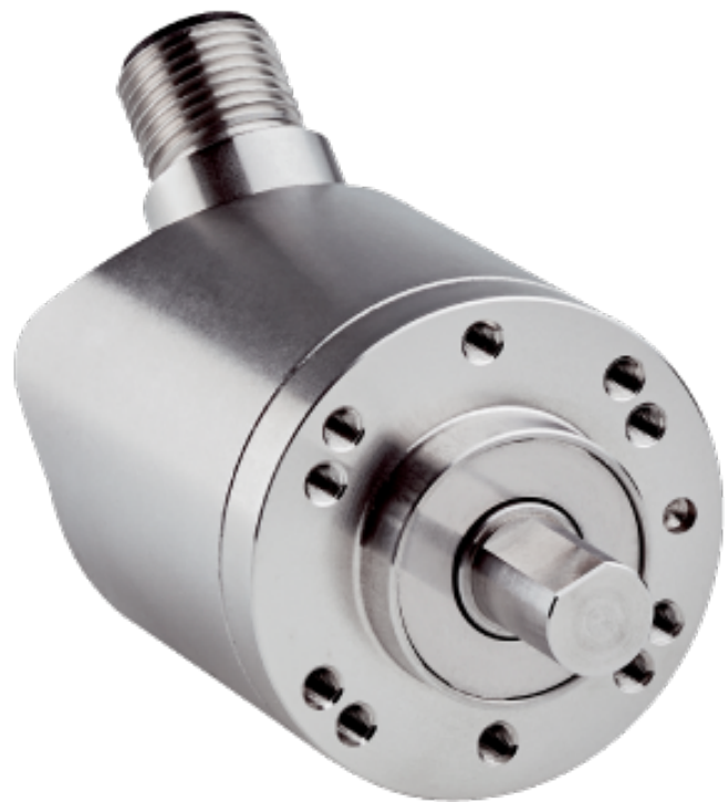
AHS/AHM36 Inox with face mount flange and M12 male connector