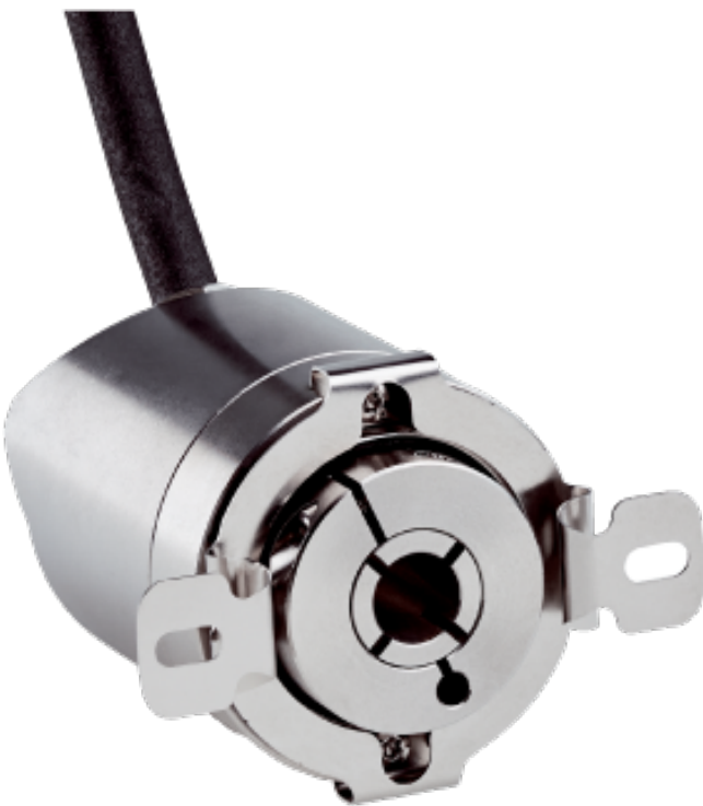
AHS/AHM36 Inox with blind hollow shaft and cable connection

The solution for applications with particularly harsh ambient conditions is AHS/AHM36 stainless steel Inox encoders. The housing, flange, shaft and stator coupling are made entirely of stainless steel (1.4305). Enclosure rating IP69K ensures additional impact protection which protects the shaft sealing ring installed in the encoder from the water jet of the shock blower.