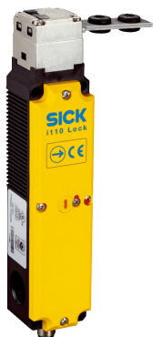
actuator not supplied with delivery