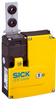
actuator not supplied with delivery