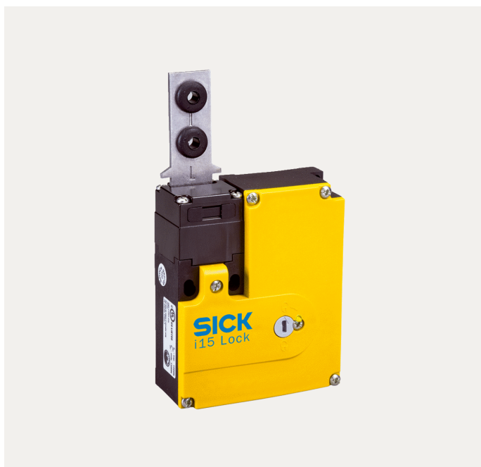
actuator not supplied with delivery