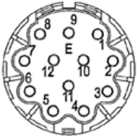
View of the connector M23 fitted to the encoder body