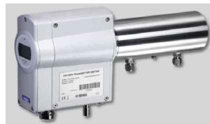
OMT355 with the sampling cell.

The Vaisala SPECTRACAP® Oxygen Transmitter.